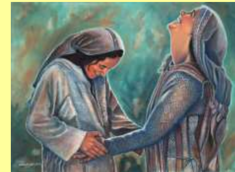
Feast of the Visitation of the Blessed Virgin Mary, May 31 st

Single and Catholic? We know about the married and religious vocations, but what about the baptismal vocation we all have? Join us this June for a 4-week online interactive series that will help equip you to more fully discover and effectively live your baptismal vocation! Capacity is limited. Sign up today. For more information and to register visit: https://nationalcatholicsingles.com/mission-possible-living-your-baptismal-vocation/