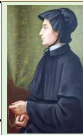
St. Elizabeth Ann Seton

THIS HEAVENLY BREAD OF ANGELS REMOVES MY PAINS, MY CARES – WARMS, CHEERS, SOOTHES, CONTENTS, AND RENEWS MY WHOLE BEING