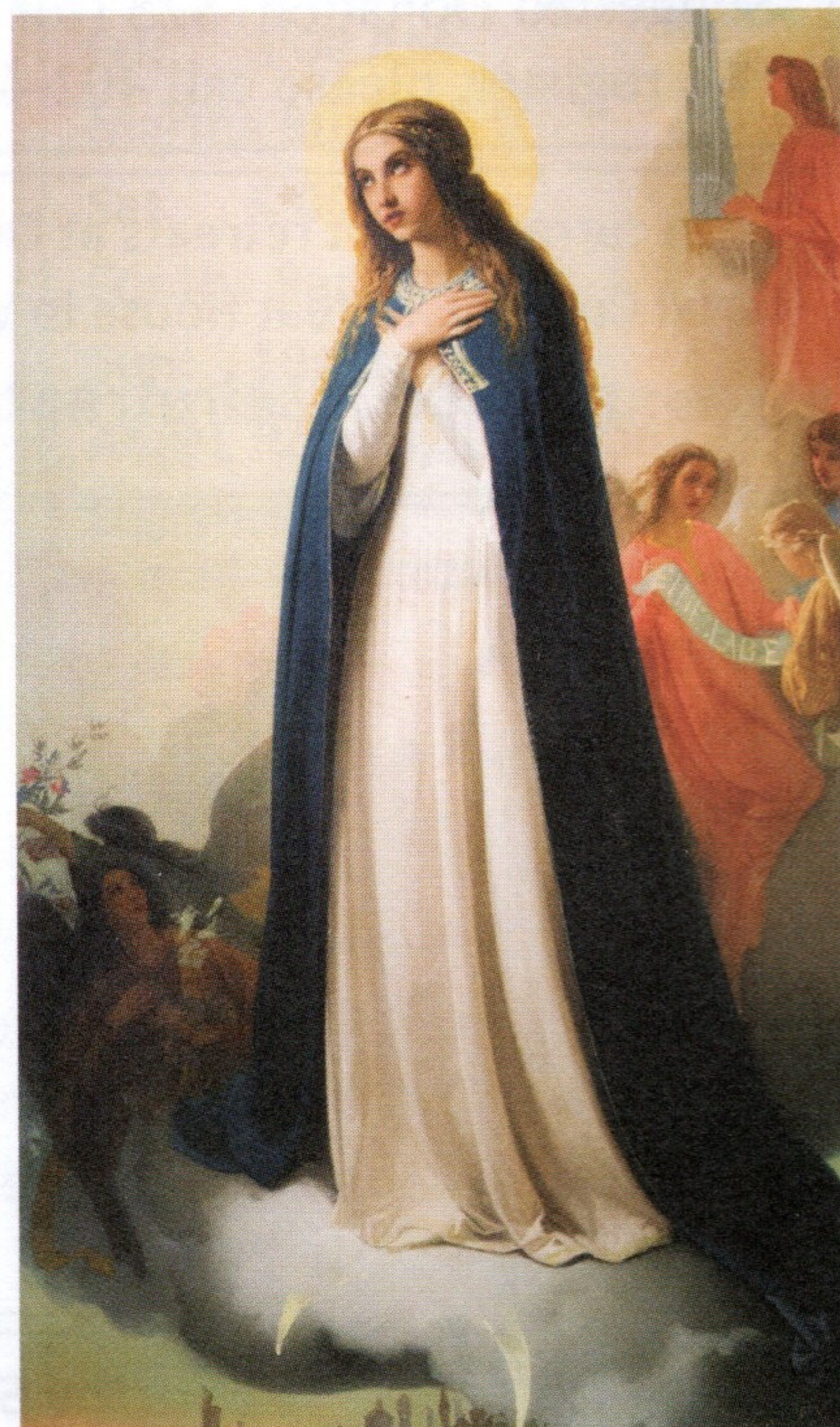
THE ASSUMPTION OF THE VIRGIN MARY, PAVIA CATHEDRAL

From Catholic and Cornered: Answers to Common Questions About Your Faith , © 2011 Liguori Publications