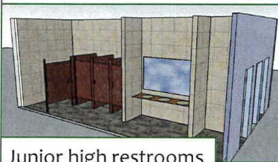
Junior high restrooms