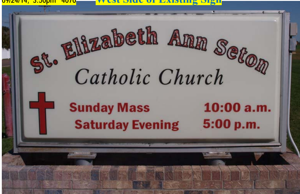
West Side of Existing Sign