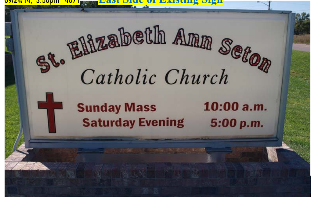
East Side of Existing Sign