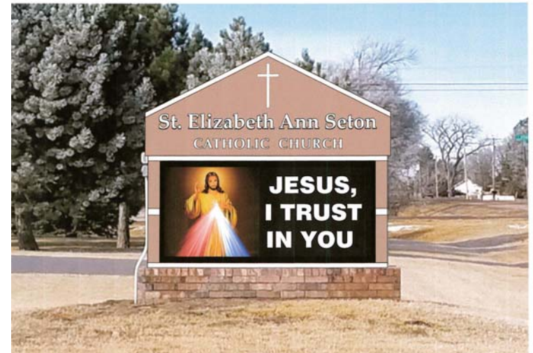
3' x 7' Sign with NO Pedestal

Condon Signs Proposal: We hereby propose to furnish all labor, material and equipment to remove existing sign and discard. Furnish (2) new steel columns and weld onto existing pipe and concrete footing. Furnish new top I.D. sign and bottom decorative pole cover, fabricated from aluminum skins and steel interior frame. Top I.D. sign to be internally illuminated with LED lighting and power supplies, decorated with routed push-thru acrylic and painted color of customer's choice. Sign to include (1) new 4' x 8' double-sided 16mm full color Watchfire message center , complete with Ignite OP graphics software, capable of pre-recorded video, animated text and graphics. Communication will be 4G wireless broadband with 5-year cellular data plan, 5-year parts warranty through Watchfire Signs, and 5-year labor warranty through Condon Signs, free life of sign software training. Total cost for signs, permits, removal and installation: $43,974.00.